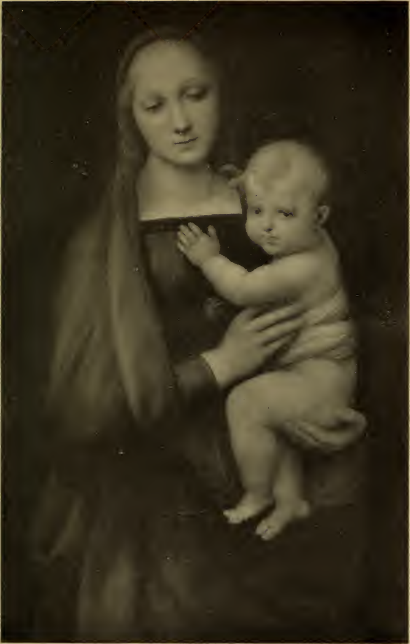
MADONNA DEL GRANDUCA